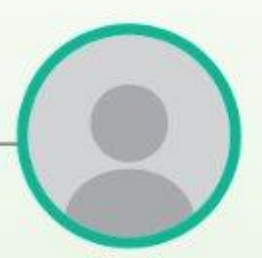
Vacant State Director (IDEA)