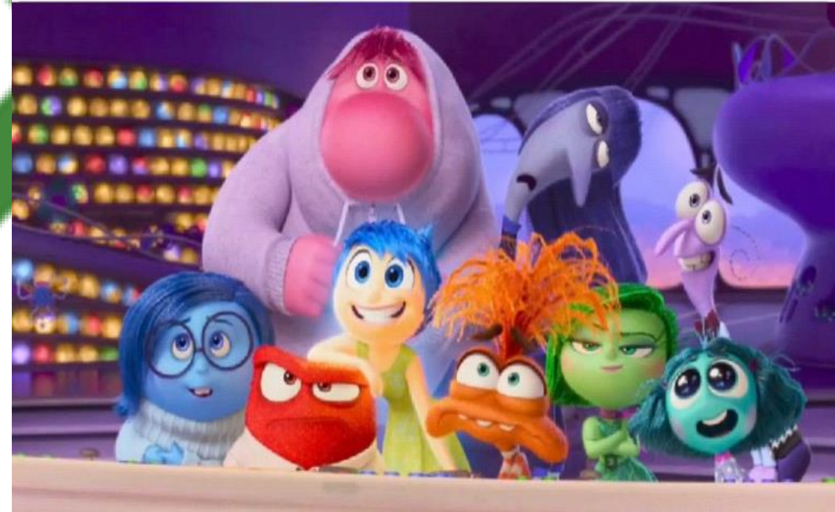
Disney Pixar's Inside Out 2